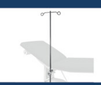
IV pole with 2 hooks Ref. 985-01